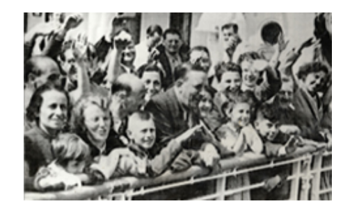
JDC and the SS St. Louis

Explore primary sources on JDC assistance to 907 Jewish refugees in 1939 after SS St. Louis was turned back from Cuba.