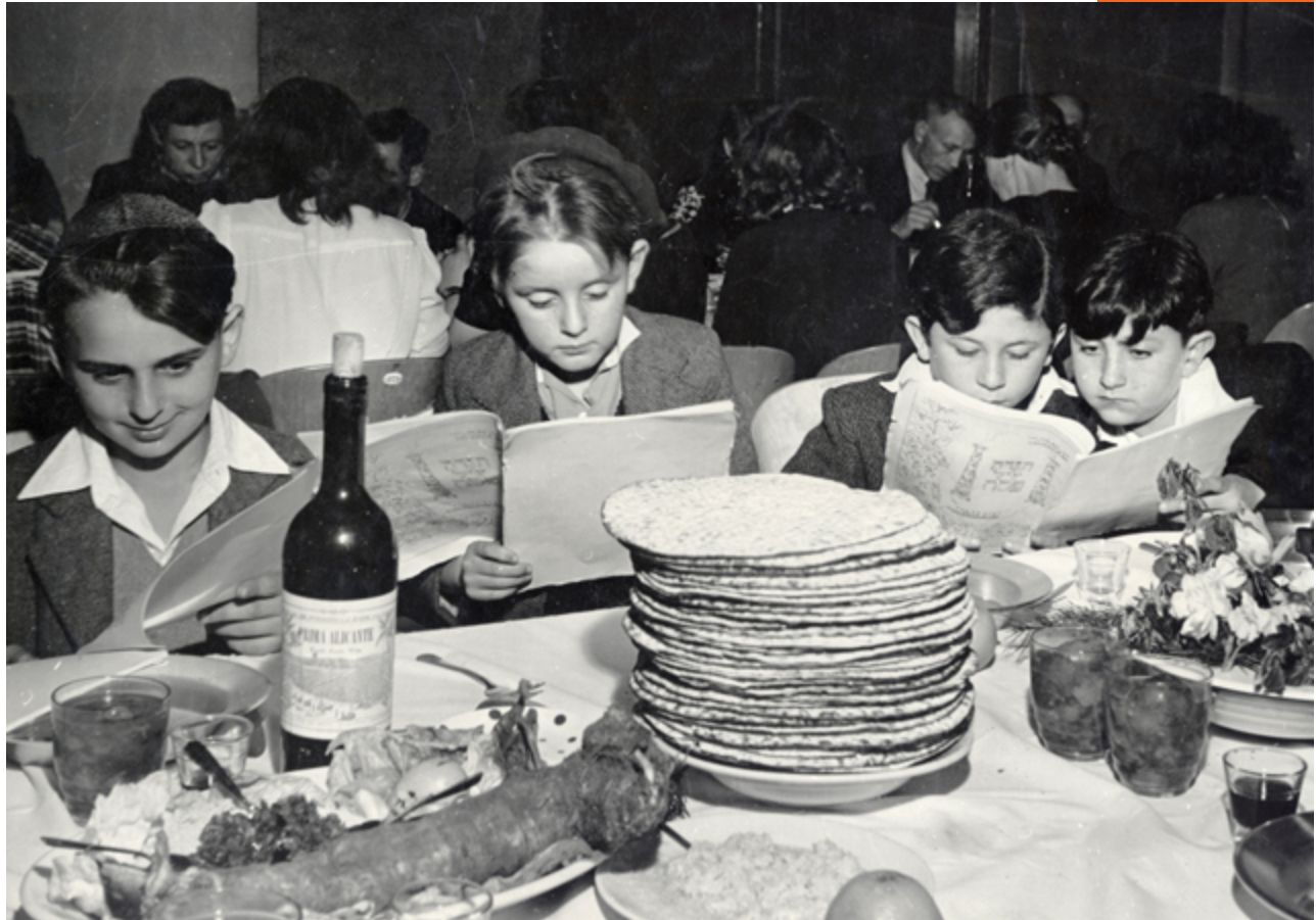
Children at a communal seder in the Ilaniah Children's Village. Apeldoorn, Netherlands, c. 1948. View more celebrations around the world in our Passover photo gallery .