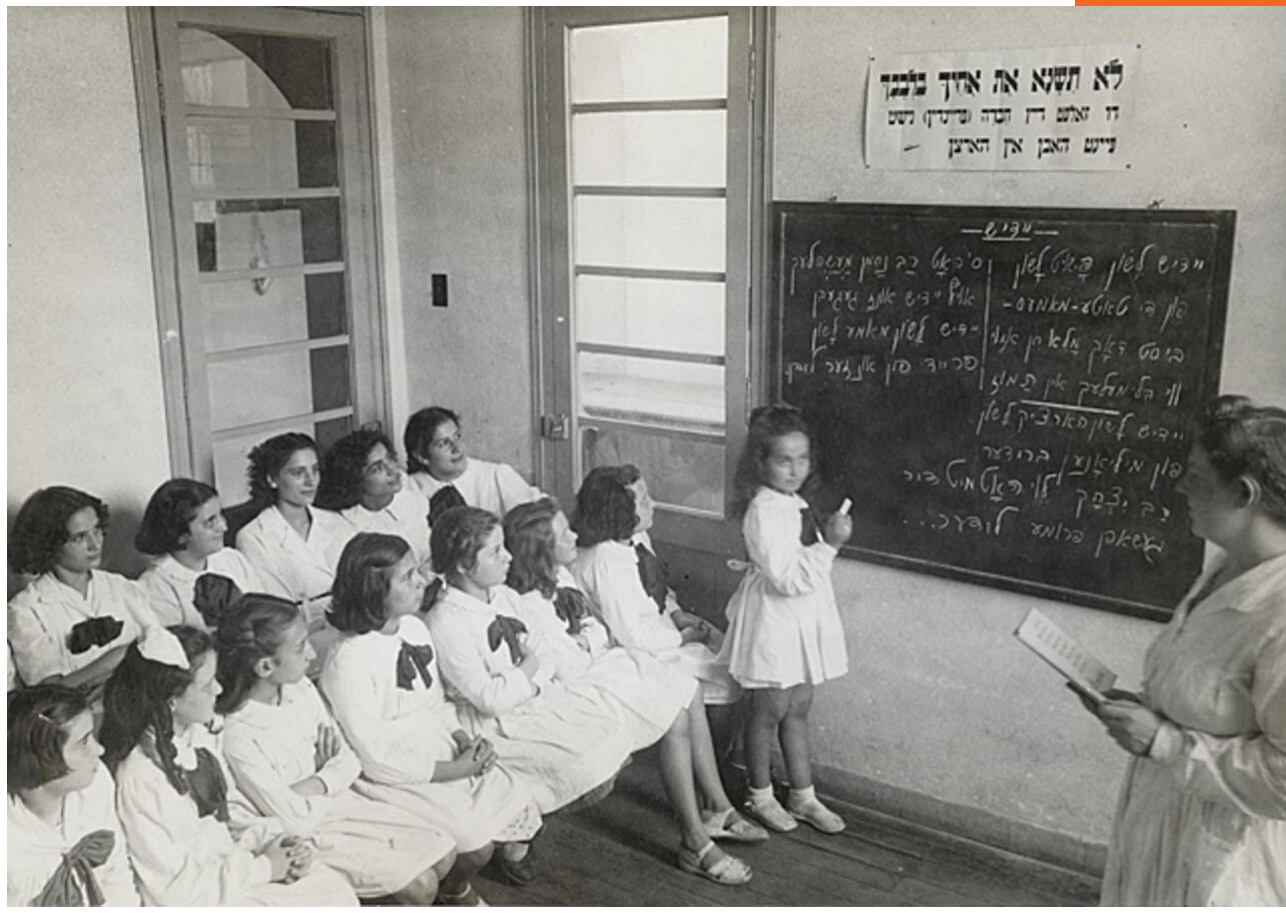
Girls learning in the Beth Jacob School in Montevideo, December 1944. Can you identify anyone in this photo? View this and more photos of JDC refugee aid in Uruguay.